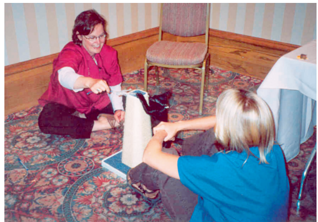
Two solutions for helping cats to keep their claws trimmed: the upper photo shows a commercially available version of an inclined plane covered in sandpaper; the bottom photo shows a scratching post covered with jute rope. Both of these can be incorporated into play with cats to encourage their use as "nail files."

banishment, release, and toy offer cycle. Most play is about attention so this strategy usually works.